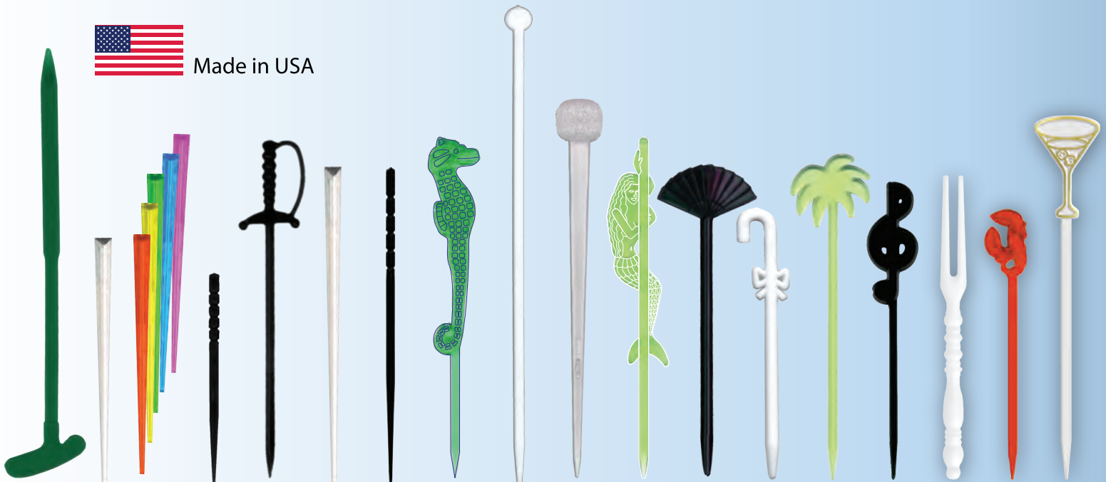
D51 D60 D60 D62 D63 D67 D69 D70 D71 D72 D73 D76 D81 D83 D84 D87 D89 D93 Asst